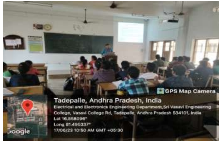
LECTURE HALL NO: 306