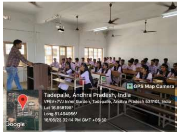
LECTURE HALL NO: 302