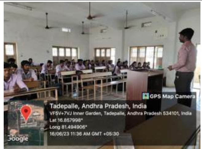
LECTURE HALL NO: 301