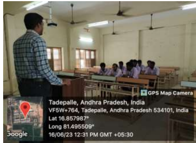
LECTURE HALL NO: 105